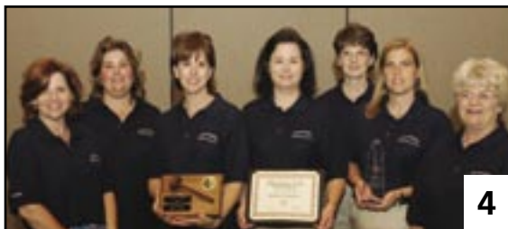
4. The Dallas Chapter displays its Innovator Gavel Award and honorable mention for Chapter of the Year.