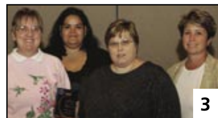
3. Third place honors for the Dream Theme Contest went to the SunCoast Bay Area Chapter.