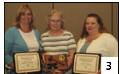
3. The Rainier Chapter, winner of the Mentor Gavel Award, honorable mention for Chapter of the Year, and honorable mention for the Dream Theme Contest.