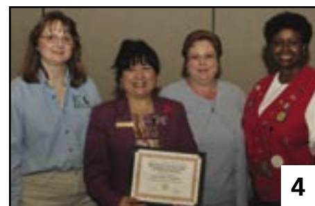
4. California Payroll Conference 9 chapters take home an honorable mention award for the Dream Theme Contest.