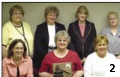
2. The Siouxland Chapter shows off its Facilitator Gavel Award.