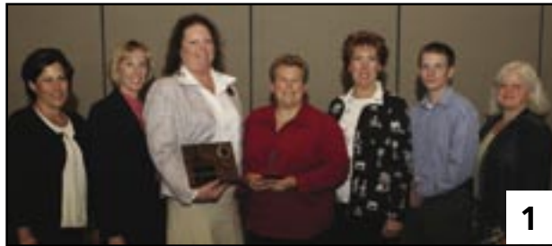
1. The Central Iowa Chapter APA accepts the Communicator Gavel Award and third place Best Chapter Web Site Award.

The Mentor Gavel Award was presented to the Rainier Chapter (Redmond and Seattle, WA) for members' voluntary guidance and assistance of other chapters and groups in the areas of education, certification, community service, meetings, and inter-chapter activities. The Innovator Gavel Award was awarded to the Dallas Chapter (Dallas, TX) for its groundbreaking ideas and projects in the areas of government, membership, and meetings.