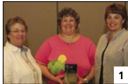
1. Indiana chapter members beam with pride over their first place Dream Theme Contest trophy.

Honorable Mentions: South Carolina Chapter, North Carolina State Chapter, and Charlotte Chapter (for the Carolinas Payroll Conference)—“Grand Ole' Payroll”; Rainier Chapter (for the Northwest Regional Payroll Conference)—“Cruising in 2004”; and East Bay Chapter, Sacramento Valley Chapter, San Francisco Bay Area Chapter, and South Bay Area Chapter (for the California Payroll Conference 9)—“Harvest the Grapes of Knowledge.”